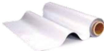
Magnetic Fine Art Paper Magnetic Canvas