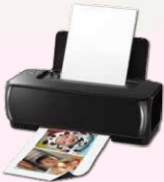
print a magnetic photo paper